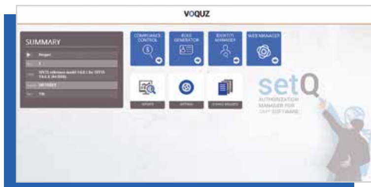
Figure 1: setQ user interface – your cockpit for easy authorization management

Even during the plug-and-play creation of new roles and concepts, setQ runs real-time checks for critical SOD conflicts in the background and can prevent them from being pushed to production automatically. The deployment of your new roles follows a transparent ruleset and does not require complicated tinkering to get started. While legacy Identity Management for SAP requires complex knowledge and months of setup and refinement, a setQ install is fast and simple.