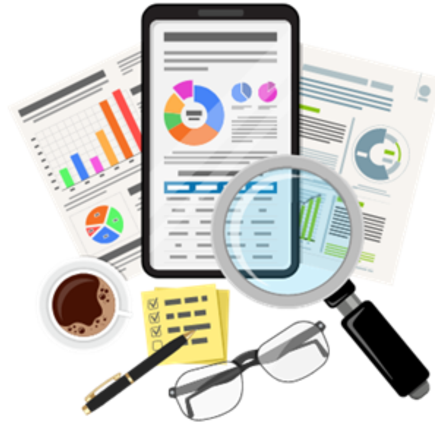
Research & Evaluation Services