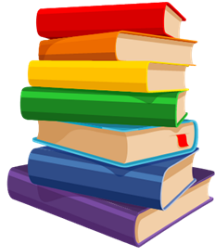
Early Childhood Programs for Literacy