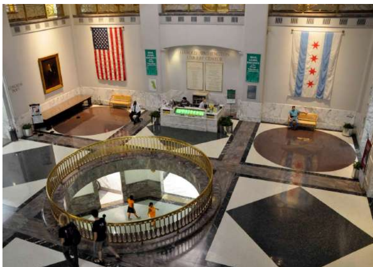
Harold Washington Library 400 S State St, Chicago, IL 60605