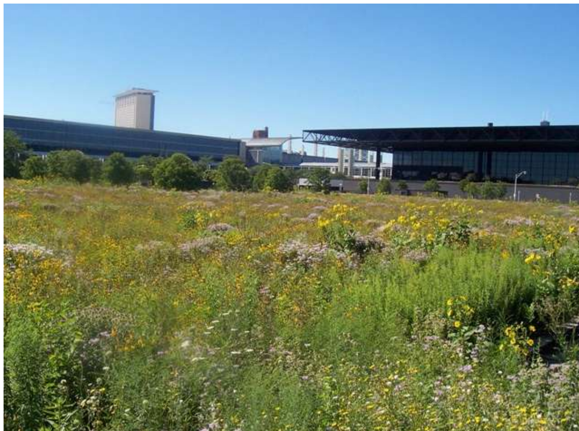
McCormick Bird Sanctuary 2400 S Lake Shore Dr, Chicago, IL 60616