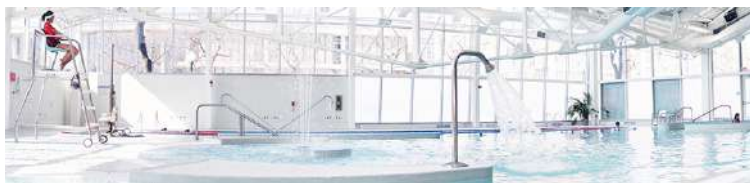
UIC Student Recreation Facility 737 S Halsted St, Chicago, IL 60607

as well. This is an especially good idea for something to do during the warmer months since it helps to cool off. Now that I've given you these ideas, you are ready to have an enjoyable weekend for under $20. Please note that all these things I have mentioned are but only a few options for enjoyable and cost-effective activities. You might have other things that you already like to do on weekends as well. For instance, you may have a hobby you love to do or perform a community service to help feel good about the way you choose to manage your free time. Whatever you decide, I hope you'll still take my ideas into consideration the next time you don't have anything better to do on the weekend. Well, goodbye for now and have a wonderful weekend.