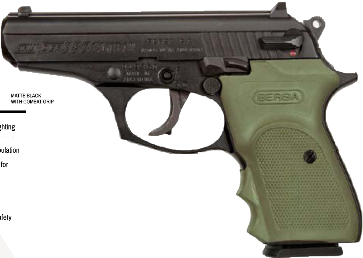
MATTE BLACK WITH COMBAT GRIP