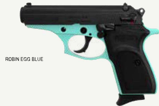
ROBIN EGG BLUE