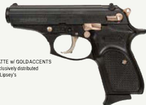
MATTE w/ GOLDACCENTS Exclusively distributed by Lipsey's