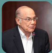
Dr. Nicolás Ardito Barletta

Former President of Panama & Vice President World Bank