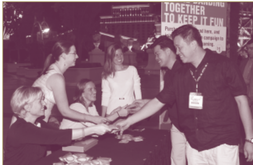
G2E participants “Keep It Fun” by purchasing awareness wristbands at the welcome reception.