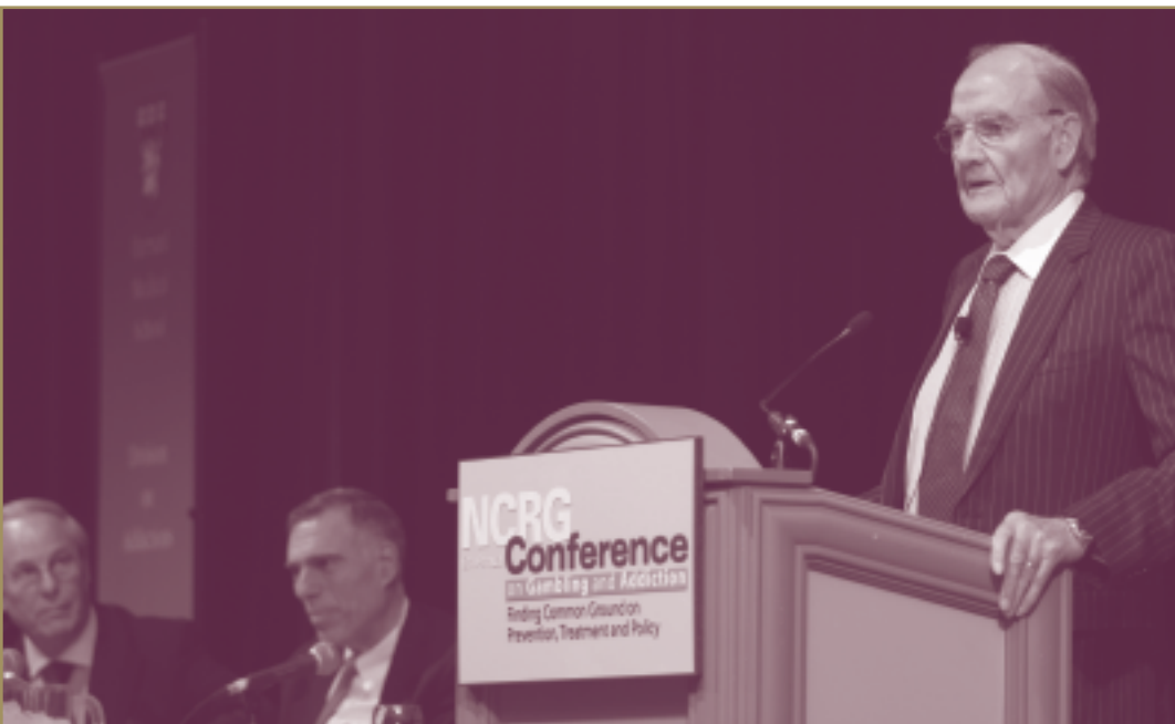
Scenes from the sixth annual NCRG Conference on Gambling and Addiction, held Dec. 7-8, 2005 in Las Vegas.

NCRG conference sponsors in 2005 included Ameristar Casinos, Inc., Aristocrat Technologies, Inc., Association of Gaming Equipment Manufacturers (AGEM), Bally Gaming and Systems, Foxwoods Resort Casino, Global Gaming Expo (G2E), Harmony Healthcare, Harrah's Entertainment, Inc., International Game Technology (IGT), Konami Gaming, Inc., MGM MIRAGE, Shuffle Master, Inc., Station Casinos Inc., WMS Gaming, Inc., and Wynn Resorts.