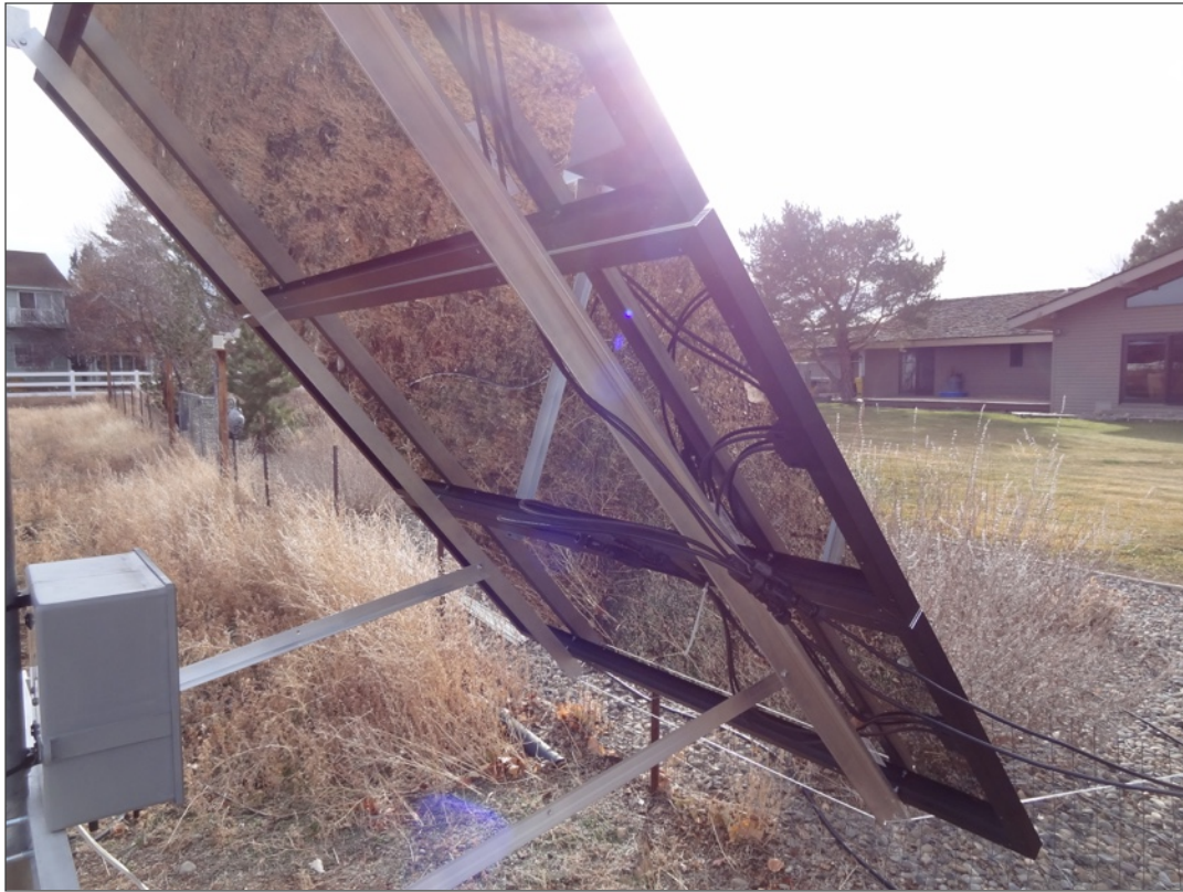
Photo is just one example of a pole-mount system by General Specialities.

You will have purchased your own pole or roof mount hardware. It will have its own assembly instructions. Proceed with that assembly now.