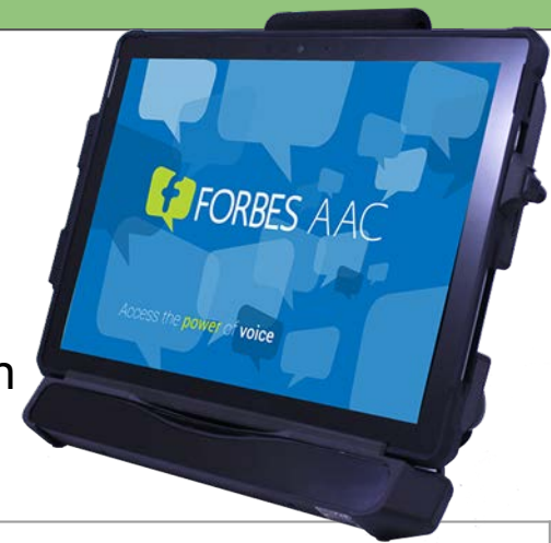
Winslate 12D with EnableEyes